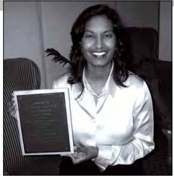
A Star Shines Brightly

Indeed volunteer physicians are the hearts that pump the patients of We Care toward health. We recognize the efforts of these stars of the medical profession who so graciously care for the less fortunate among us. We believe that all our member physicians are stars and will step forward to volunteer so that the ever-growing need for patient services will be met with a constant supply of skilled volunteer physicians.